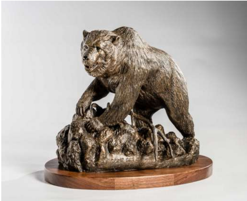
Sculpture of Grizzly Bear, COME GET IT by Rudl Mergelman Fountain Creek Productions (Size 9"x11")